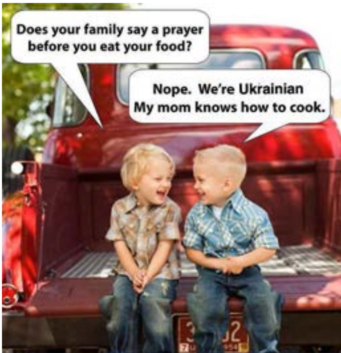
Ukrainian Covid Mask

One Sunday morning before Mass the Catholic church in a very small town was almost full and in walked the devil. Well, once everyone saw the devil they quickly ran out of the church in fear including the priest. There was one elderly lady sitting in the front pew where she usually sits. The devil walked up to her and said loudly "Why are you not afraid and running away from me?" She pointed her finger at him and sternly said, "I was married to your brother for 55 years. I am certainly not afraid of you"