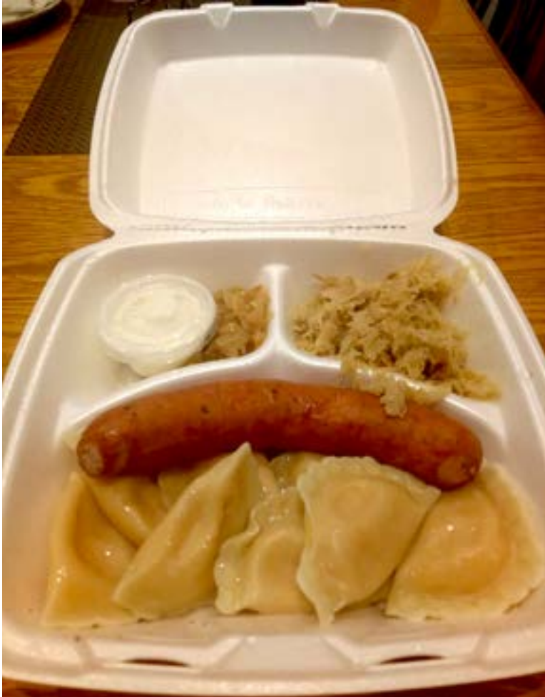
Sausage & perogy dinner offered

On Thursday October 28th council #7464 together with the C.W.L of the Church of the Resurrection held a sausage and Perogie dinner. The turn out was very good although it is take-out only.